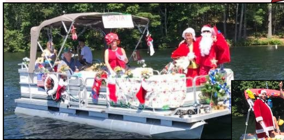
The 2017 theme was 'Christmas in July'. There were many (hot) bearded Santa's!

Don't forget to show the judges what you got as you drive by Weymouth's Point!