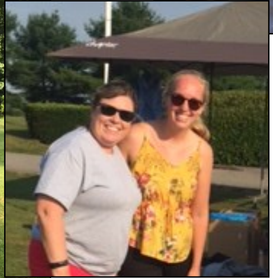
Golfers and tournament organizers making it all happen!