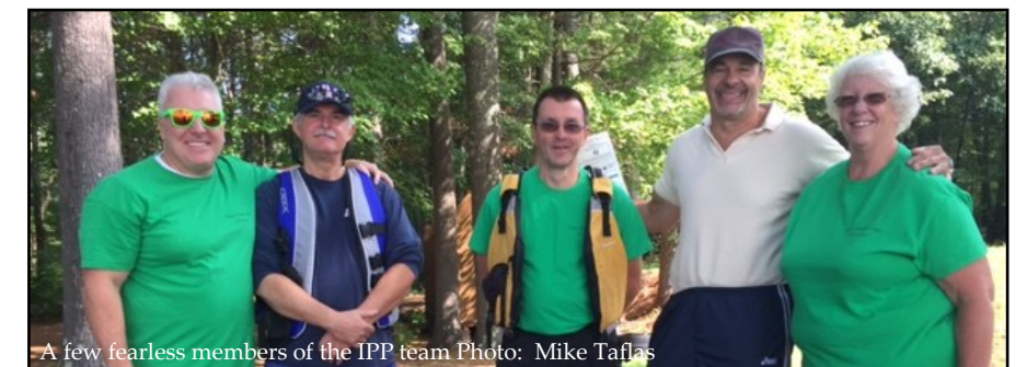
A few fearless members of the IPP team